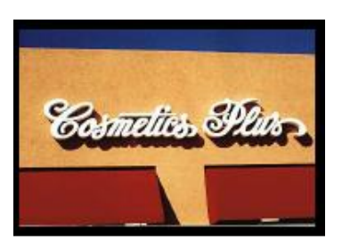
Overly-Complicated Style of Text

(4.) Avoid elaborate or confusing styles of text as illustrated in the following example.