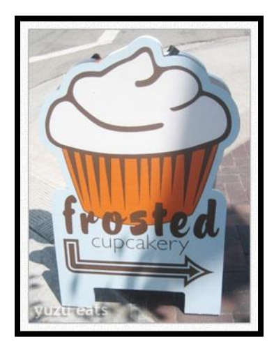
Example of Alternative Sandwich Board Sign

(G.) Alternative design for sandwich board signs . As an alternative to the standard design described above, the Planning, Zoning & Subdivision Administrator may permit alternative sandwich board sign designs which exhibit a distinctive and creative flair which the owner would otherwise be unable to replicate if the standard frame design was used. Such signs shall not contain changeable copy and images and lettering shall be permanently attached, painted, cut or carved onto the sign using a muted palette of colors. Wooden signs are preferred, but all such signs shall be made of durable materials. An example of an acceptable alternative design is illustrated in the following photograph.