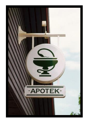
Use of Symbols

(6.) Use sign styles and designs that complement the architecture of the site where the signs are located. Granite Quarry is a historic Town so using "period" signage is strongly encouraged.