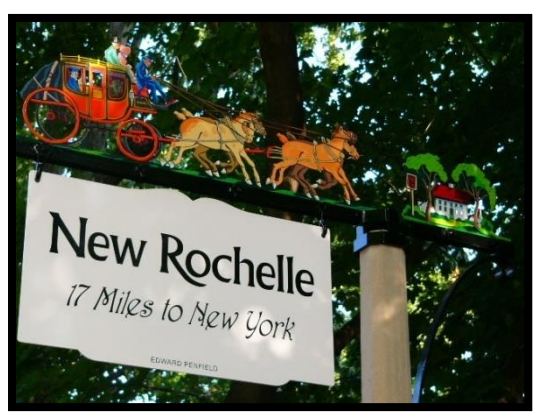
An Example of a "Period" Pole Sign in a New York City Suburb

(6.) Use sign styles and designs that complement the architecture of the site where the signs are located. Granite Quarry is a historic Town so using "period" signage is strongly encouraged.