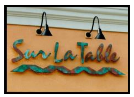
Externally Illuminated Sign

sources are preferred over internal illumination. All electrical conduit and junction boxes should be concealed.