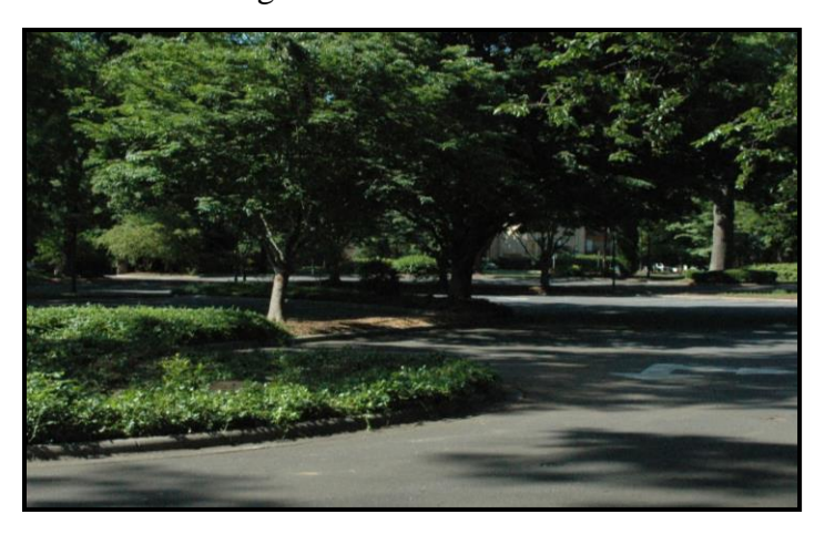
Figure 12.11-2: Example of parking lot broken up by landscaping.

12.11-3 Enclosure of Parking Lots. Parking lots shall be enclosed by tree planting and/or building walls(s). Plantings shall be in accordance with the provisions of Article 11, see 11.6-4. For small lots (thirty-six spaces or less), landscaping shall be required at the perimeter; for large lots (more than thirty-six spaces), landscaping shall be at the perimeter and placed to break the lot into parking areas of no more than thirty-six spaces.